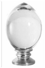
TRIBECA FINIAL SKU: MT-TRI-FIN L: 3 3/4" DIA: 2 3/8"