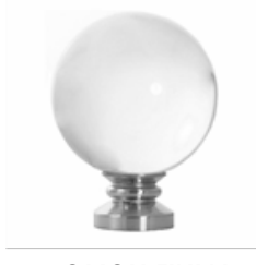
ORION FINIAL SKU: MT-ORI-FIN L: 3 1/4" DIA: 2 5/8"