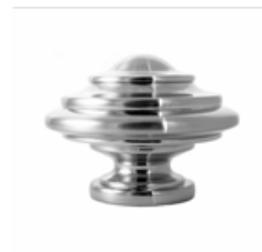
HAMPTON FINIAL SKU: MT-HAM-FIN L: 2 1/2" DIA: 3 1/4"