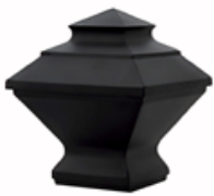
MANHATTAN FINIAL SKU: MT-MAN-FIN L: 3 3/8" W: 3"