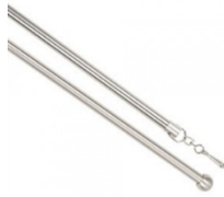
42" WAND SKU: MT-WAND-42