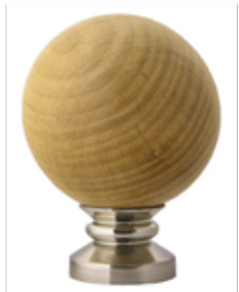
WOOD BALL FINIAL SKU: MT-WDBAL-FIN L: 3 1/4" DIA: 2 1/2"