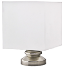
FROSTED BLOCK FINIAL SKU: MT-FRSBLK-FIN L: 3 1/8" W: 2 3/8"