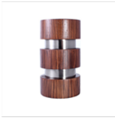
ORBIT FINIAL SKU: MT-ORB-FIN L: 4" DIA: 2 1/4"

IN STOCK FINISHES: BLACK, BRUSHED NICKEL, & BRUSHED BRASS ALSO AVAILABLE IN CUSTOM FINISHES