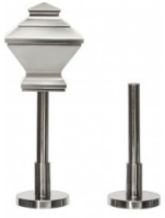
FINIAL POST 1.5"-5" PROJ SKU: MT-FIN-POST Proj: 1 1/2" – 5 Finial sold separately

IN STOCK FINISHES: BLACK, BRUSHED NICKEL, & BRUSHED BRASS ALSO AVAILABLE IN CUSTOM FINISHES