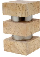
AURORA FINIAL SKU: MT-AUR-FIN L: 4" W: 2 1/4"