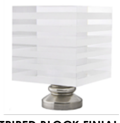
STRIPED BLOCK FINIAL SKU: MT-STRBLK-FIN L: 3 1/8" W: 2 3/8"