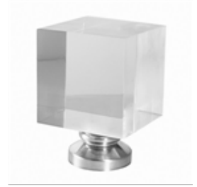
BLOCK FINIAL SKU: MT-BLO-FIN L: 2 7/8" W: 2"