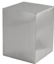
METAL BLOCK FINIAL SKU: MT-MBLK-FIN L: 2 1/2" W: 2"