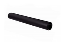
METRO TRACK SKU: MT-ROD-6FT