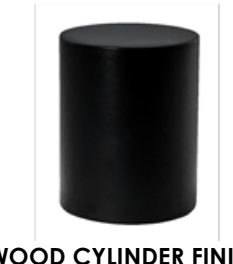
WOOD CYLINDER FINIAL SKU: MT-WDCYL-FIN L: 3" DIA: 2 1/4"