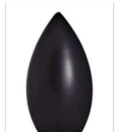
WOOD APOLLO FINIAL SKU: MT-WDAPO-FIN L: 4 1/4" DIA: 2 1/4"