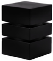
CUBIX ENDCAP SKU: MT-CUB-ECP L: 1 7/8" W: 1 3/8"