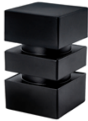
CUBIX FINIAL SKU: MT-CUB-FIN L: 3 5/8" W: 2 1/4"