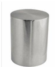
METAL CYLINDER FINIAL SKU: MT-MCYL-FIN L: 2 1/2" DIA: 2"