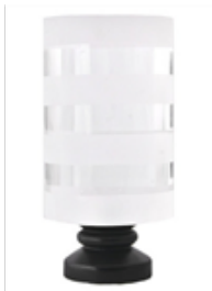
STRIPED CYLINDER FINIAL SKU: MT-STRCYL-FIN L: 3 3/4" DIA: 2"