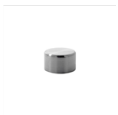
LUNA ENDCAP SKU: MT-LUN-ECP L: 3/4" DIA: 1 3/8"