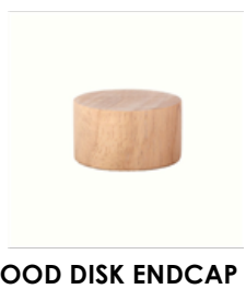
WOOD DISK ENDCAP SKU: MT-WDDSK-ENC L: 1" DIA: 1 3/4"