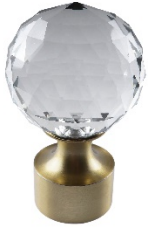
ARIA FINIAL SKU: MT-ARIA-FIN L: 3 7/8" DIA: 2 3/8"

IN STOCK FINISHES: BLACK, BRUSHED NICKEL, & BRUSHED BRASS ALSO AVAILABLE IN CUSTOM FINISHES