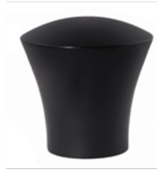
AVALON FINIAL SKU: MT-AVA-FIN L: 2" DIA: 2 1/8"