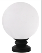
FROSTED BALL FINIAL SKU: MT-FRSBAL-FIN L: 3 1/2" DIA: 2 5/8"