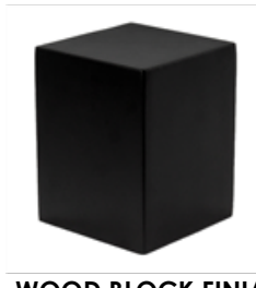
WOOD BLOCK FINIAL SKU: MT-WDBLK-FIN L: 3" W: 2"