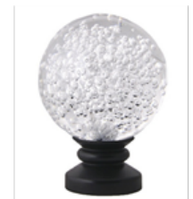
MYSTIC FINIAL W/BUBBLES SKU: MT-MYS-FIN L: 3 1/8" DIA: 2 1/4"