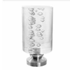
CYLINDER FINIAL W/BUBBLES SKU: MT-CYL-FIN L: 3 7/8" DIA: 2"