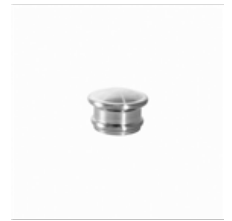
ENDCAP FINIAL SKU: MT-ENDCAP L: 1 1/8" DIA: 1 3/4"