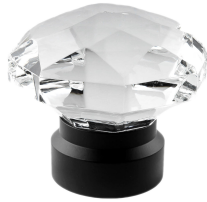
ARIES FINIAL XL SKU: PT-ARI-FINXL L: 2 5/8" DIA: 2 3/4"