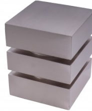
AXIS FINIAL SKU: PT-AXI-FIN L: 2 3/8" W: 2"