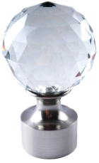
ARIA FINIAL XL SKU: PT-ARIA-FINXL L: 4 1/2" W: 2 5/8"