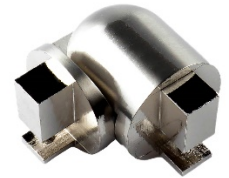
ADJUSTABLE CORNER ELBOW SKU: PT-TRKCOR-ELB