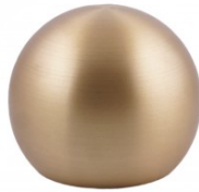
COMPASS FINIAL SKU: PT-COM-FIN L: 1 1/2" DIA: 2 1/8"