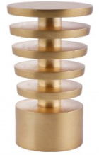
BALANCE FINIAL SKU: PT-BAL-FIN L: 3 1/2" DIA: 2 1/8"