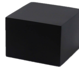
CUBE FINIAL SKU: PT-CUB-FIN L: 1 3/8" W: 2"