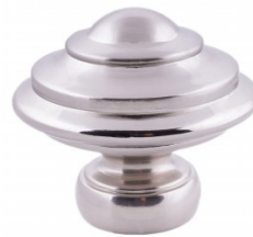
HAMPTON XL FINIAL SKU: PT-HAM-FIN-XL L: 3 1/4" DIA: 3 1/2"