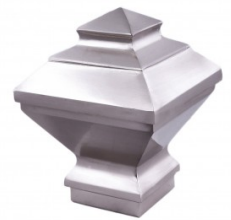
MANAHTAN XL FINIAL SKU: PT-MAN-FIN-XL L: 4 3/8" W: 3 1/2"