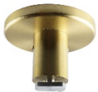
CEILING BRACKET 1.5" PROJ SKU: PT-TRKBRKT-CLG1.5 Dia: 2 1/8" Return: 1 1/2"