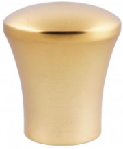
TITAN FINIAL SKU: PT-TIT-FIN L: 3" DIA: 2 3/4"