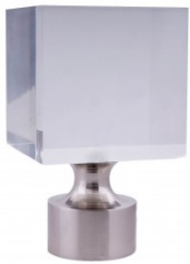
BLOCK FINIAL XL SKU: PT-BLO-FINXL L: 4 3/4" W: 2 3/4"