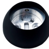
INSIDE MOUNT BRACKETS (PAIR) SKU: PA-BRKT-INSMT Dia: 1 3/4" Depth: 3/4"