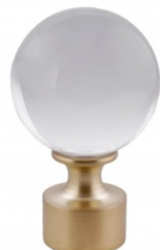
ORION FINIAL XL